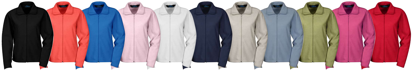
Black Coral Imperial Blue Light Pink Marshmallow Navy Oatmeal Pale Blue Pear Raspberry Red